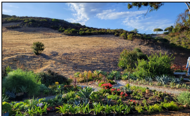
Oceana's Garden Club Nursery