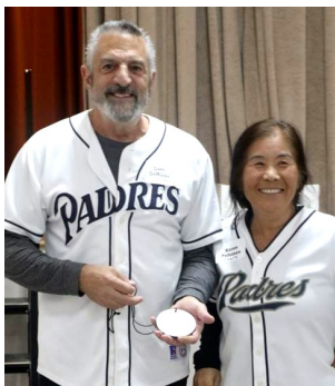
"Reggie" & the "Shark"

Contestants threw 5 "pickle" balls into a pitching net area. A point was awarded for getting it into the main strike zone, but scored 2 points if it hit the smaller target area. The last ball was worth double.