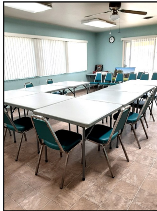
Our New Community Room

cards, puzzles, games, a small meeting area for meetings like Landscape, Website, Mahjong, Bridge, etc. There are 9 new card tables and 4 chairs each table. It is ready to make reservations by calling the office. If your group wants the room for a specific day each week, like Mahjong, call the office and they will make sure it's yours.